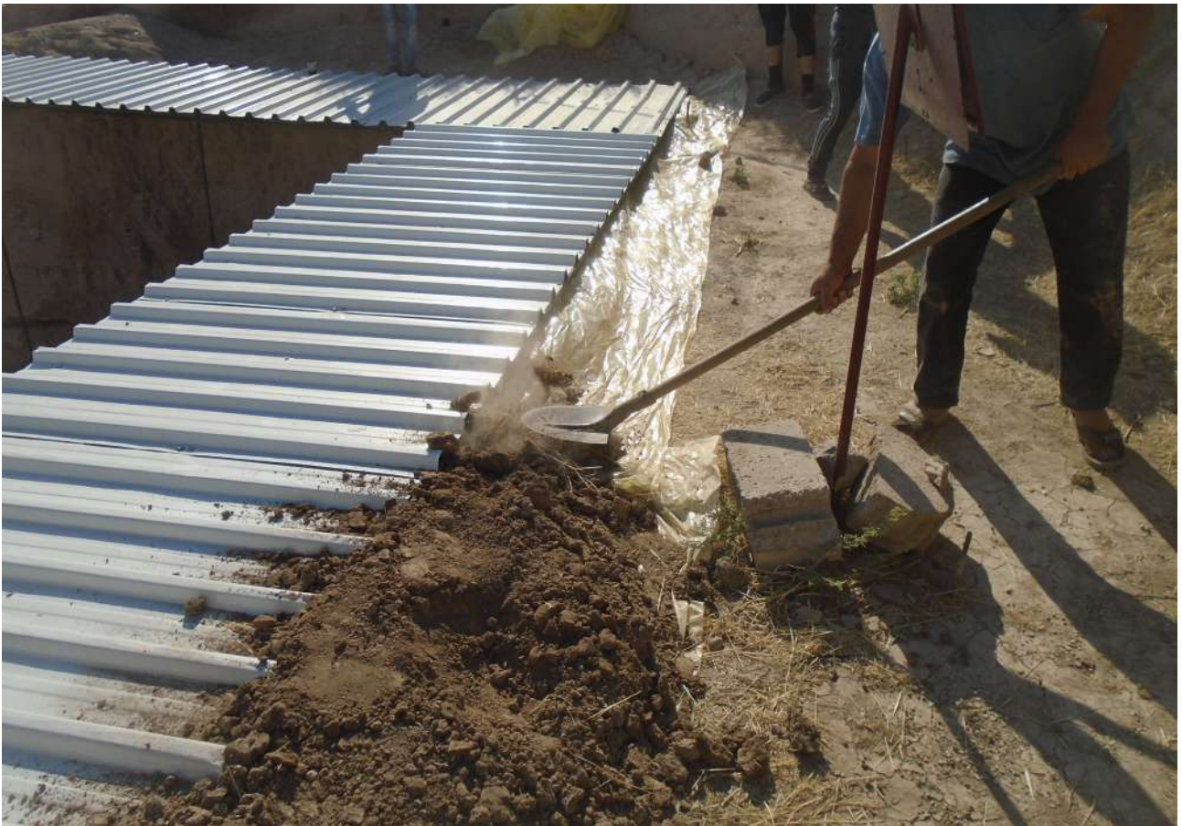
Fig.28 . Covering the edges of tutia with soil - the unit J1