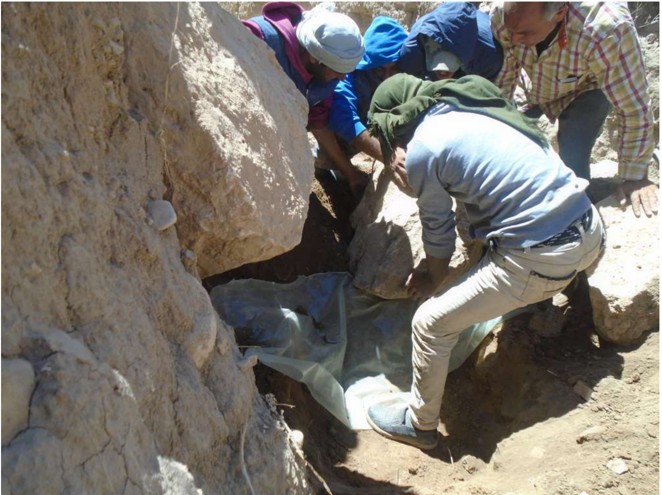
Fig.6 . Using plastic ( Nylon ) under the stones - the unit J5

After cleaning the unit from the soil and reaching to the excavated level, we have put a plastic ( Nylon ) ( Fig.6 ), then the biggest stones as base .