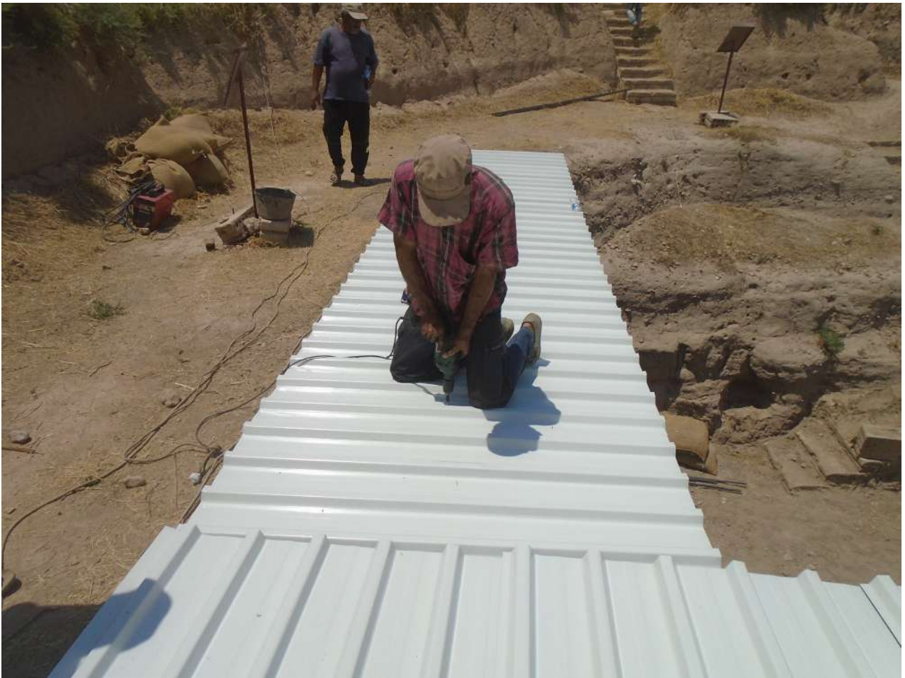
Fig.25 . Fixing the tutia with the iron rods - the unit J1