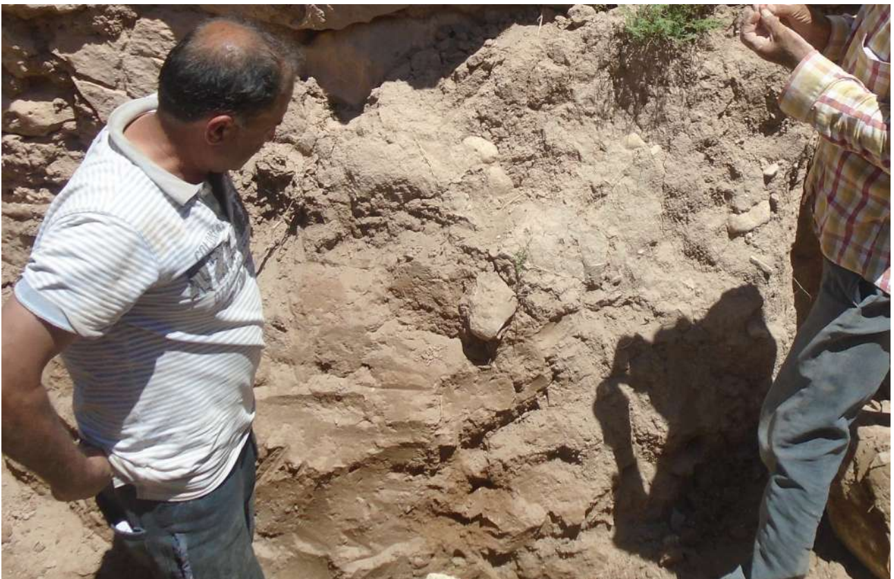
Fig.5 . The soil which remained and still sticking on the Temple's wall - the unit J5