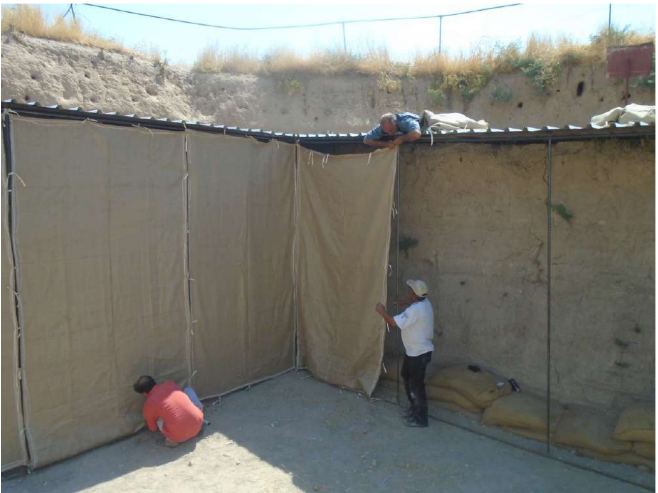
Fig.32 . Fixing the curtain on iron rods by ribbons - the unit J1