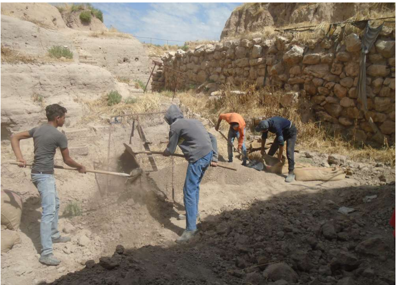
Fig.14 . Sifting the soil - the unit J1