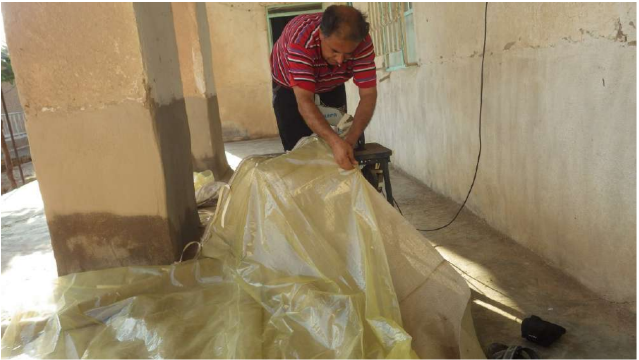
Fig.31 . Sewing the burlap with plastic ( Nylon )