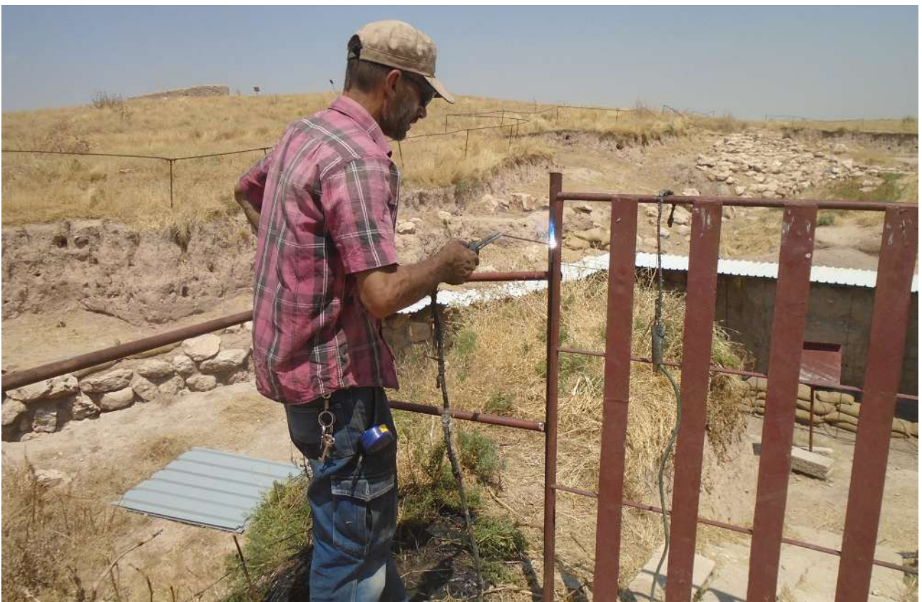
Fig.26 . Welding the iron door in the unit J1