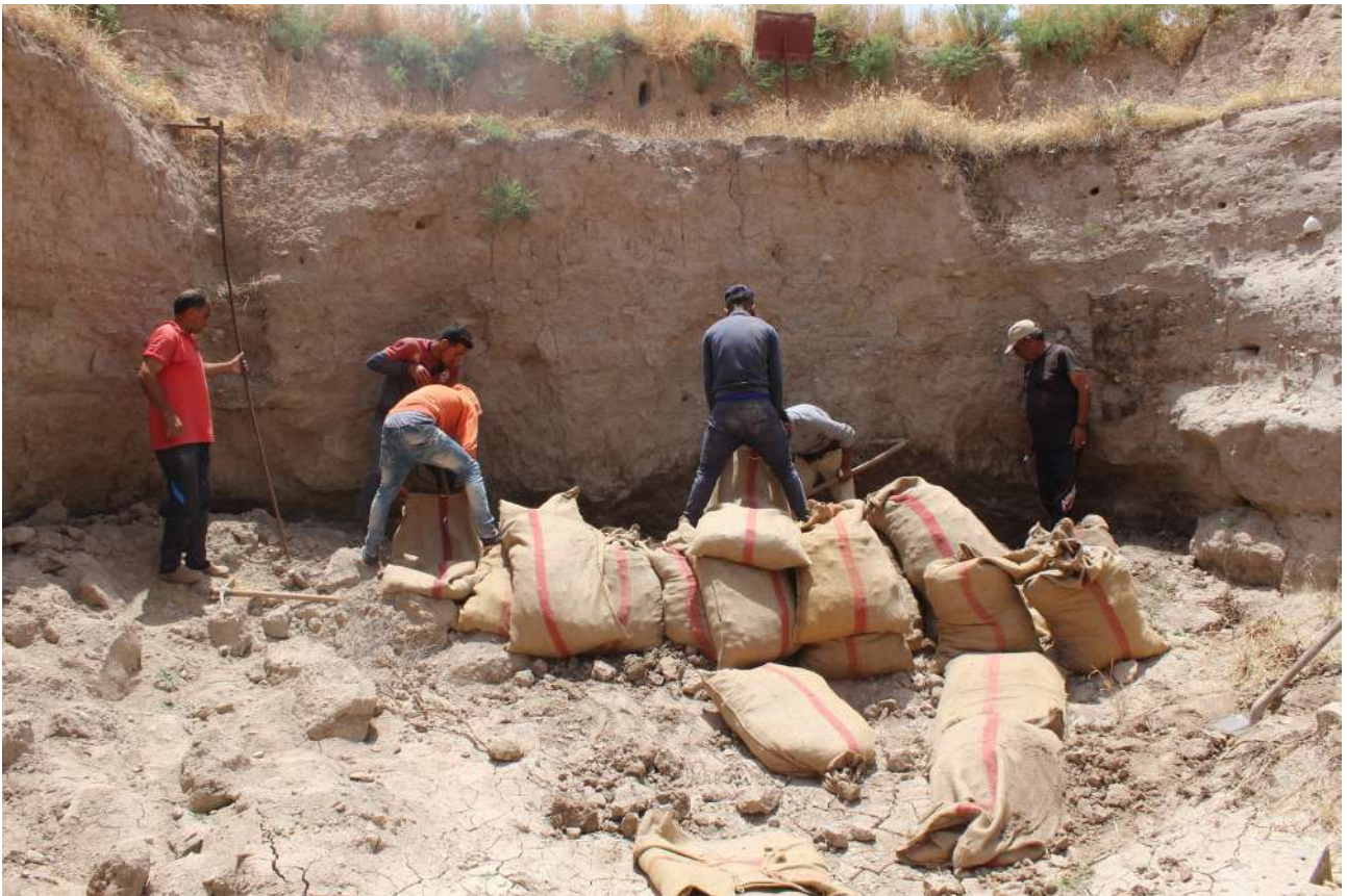
Fig.12 . Filling the bags - the unit J1