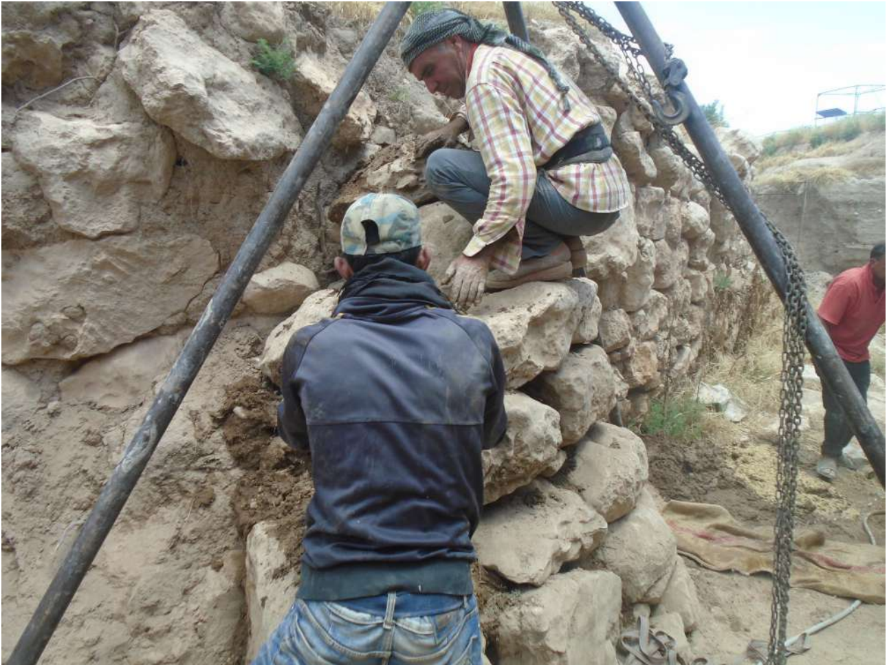
Fig.8 . Filling the gaps between the stones with mud - the unit J5