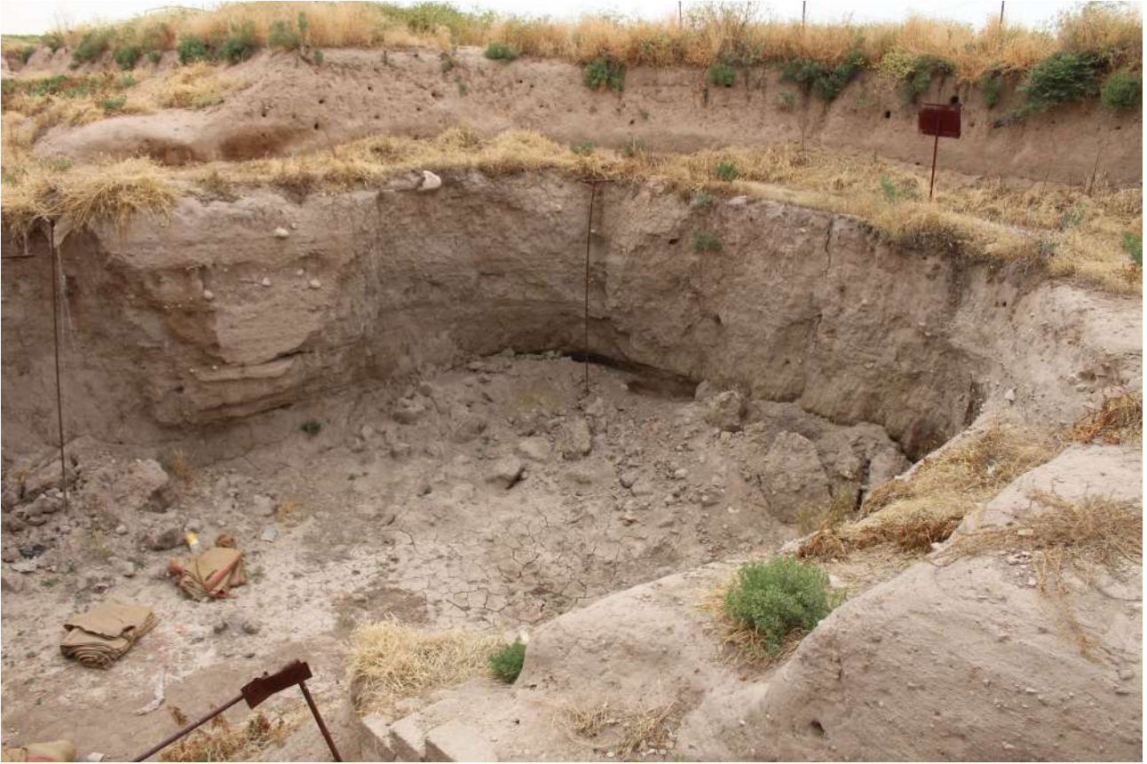
Fig.2 . The unit J1 before the work

Because of the inability of the Mission's workers, Mohammed Omo, Ibrahim Khello and Mohammed Hamza (Hammadi) to perform stressful works, I had to rely on other workers beside them ( 4 workers ) to do the works such as removing the soil and filling it in bags, also lifting bags and large stones . The work continued ten days but non-continuously because of the lack of workers due to harvest season province of Hasaka .