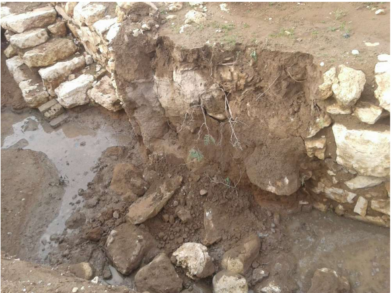
Fig.1 . The crumbled buttress in the unit J5

Due to the extraordinary weather conditions which prevailed the province of Hasaka last winter, Tell Mozan site was subjected to some damages, where the buttress which used to support the wall of the temple in the unit J5 ( Fig. 1 ) and the soil of the unit J1 have crumbled in the area J ( Fig.2 ) . So we immediately alerted the team of the Mission in order to find an urgent solution. After careful analysis and consulting, we have identified a suitable strategy to secure the area and the ancient wall structures . But we couldn't intervene immediately to repair the damages, because of the heavy rain through the spring, so we had to wait until the end of May where the weather became appropriate for the work .