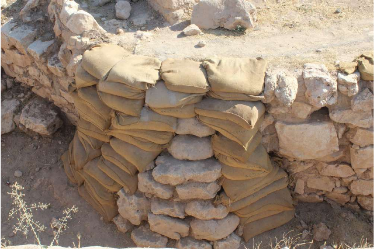
Fig.21 . The new buttress - the unit J5

The sixth day, on Tuesday 25 / 6 / 2019 :