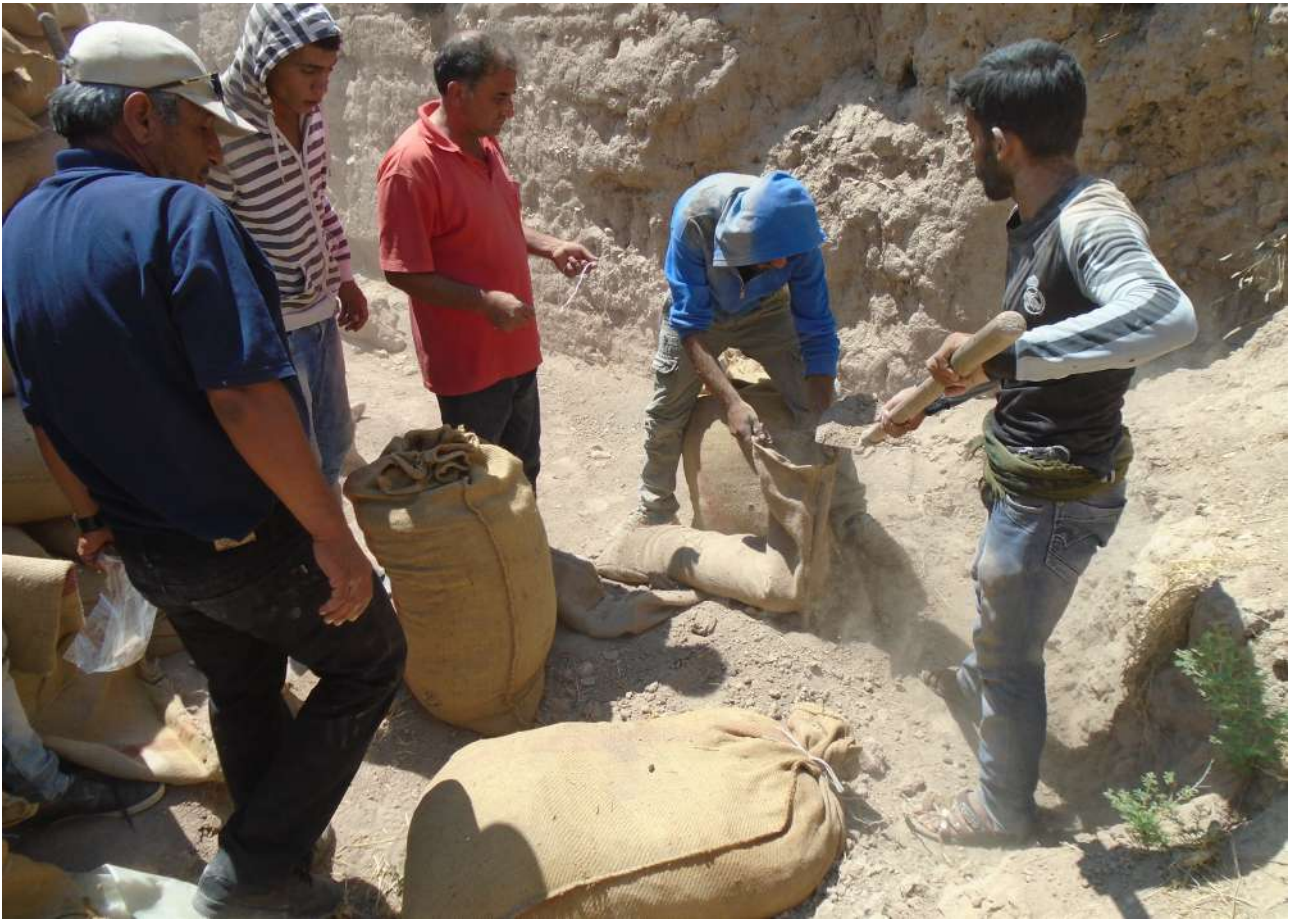
Fig.19 . Removing soil from the collapsed section in front of the buttress