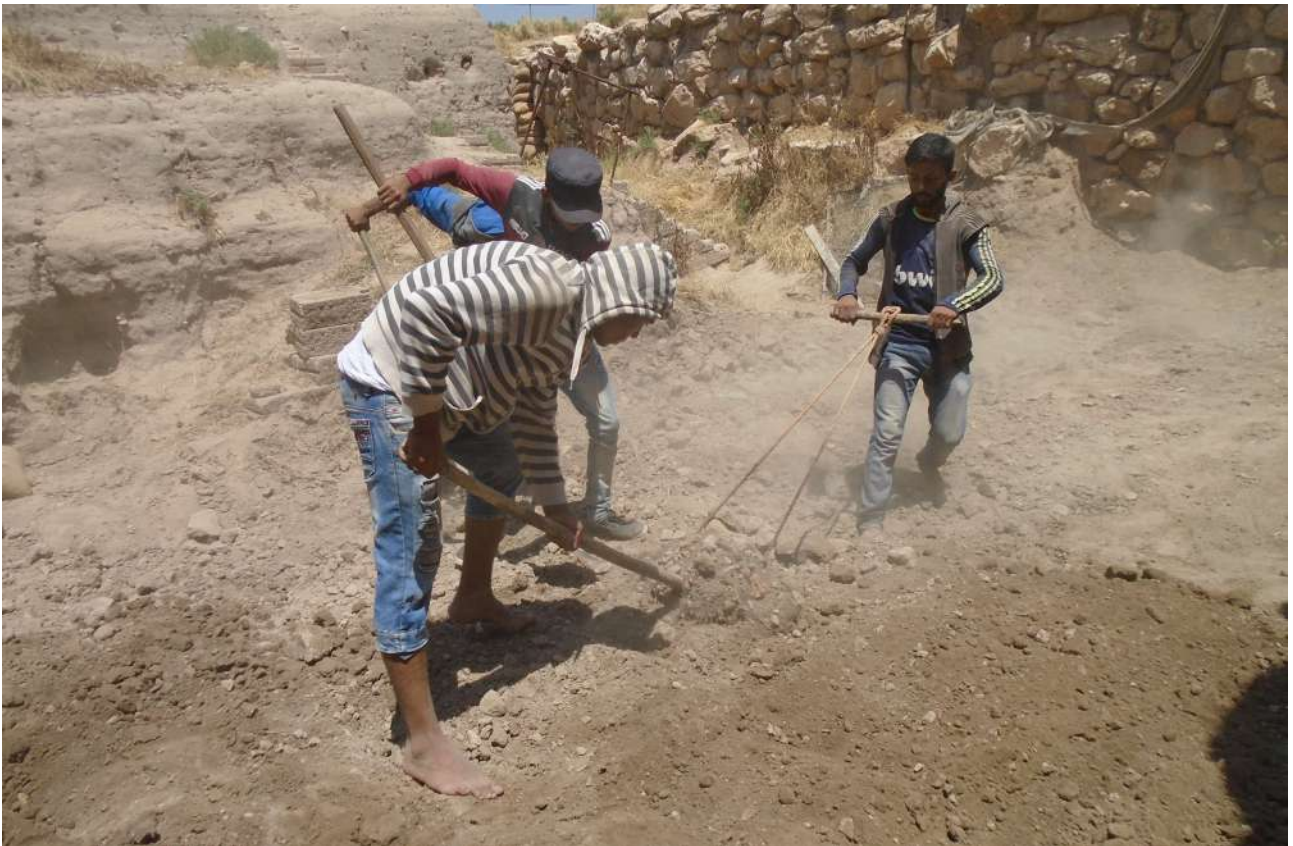
Fig.22 . The process of leveling the soil in the unit J1