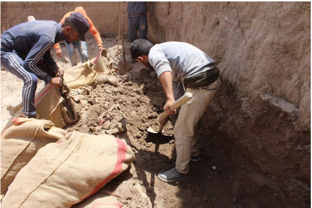
Fig.11 . The work began in the unit J1

As for the unit J1, we began to remove the soil beside the wall of the section from both south and east sides ( Fig.11 ), in order to reach the position where we can put the bags and to be sure that the wall of the section will be protected, the extracted soil was directly being filled in the bags ( Fig.12 ) .