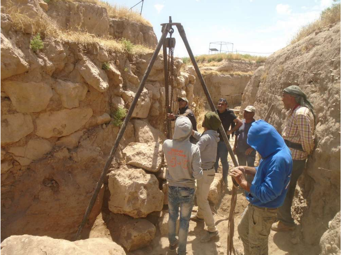
Fig.7 . Instrument of al-Wensh - the unit J5

The stones have been lifted by al-Wensh, so was the mud (a mixture of soil, straw and water) , in order to cover the gaps between the stones ( Fig.8 ).