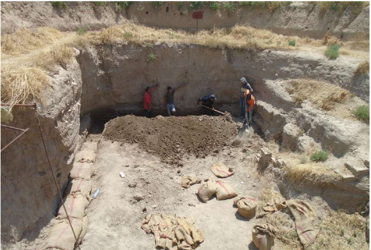
Fig.13 . The work is continued in the unit J1