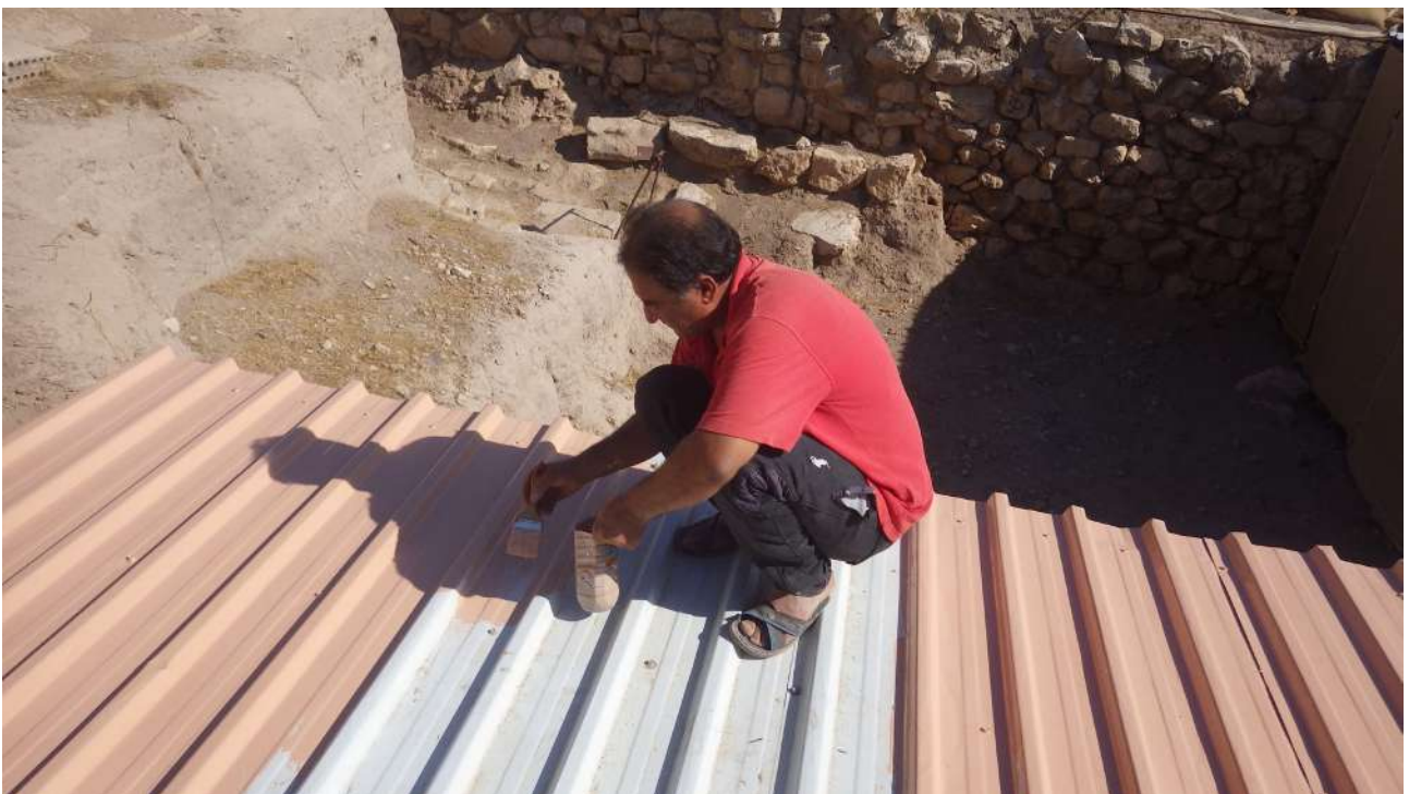
Fig.35 . The painting process