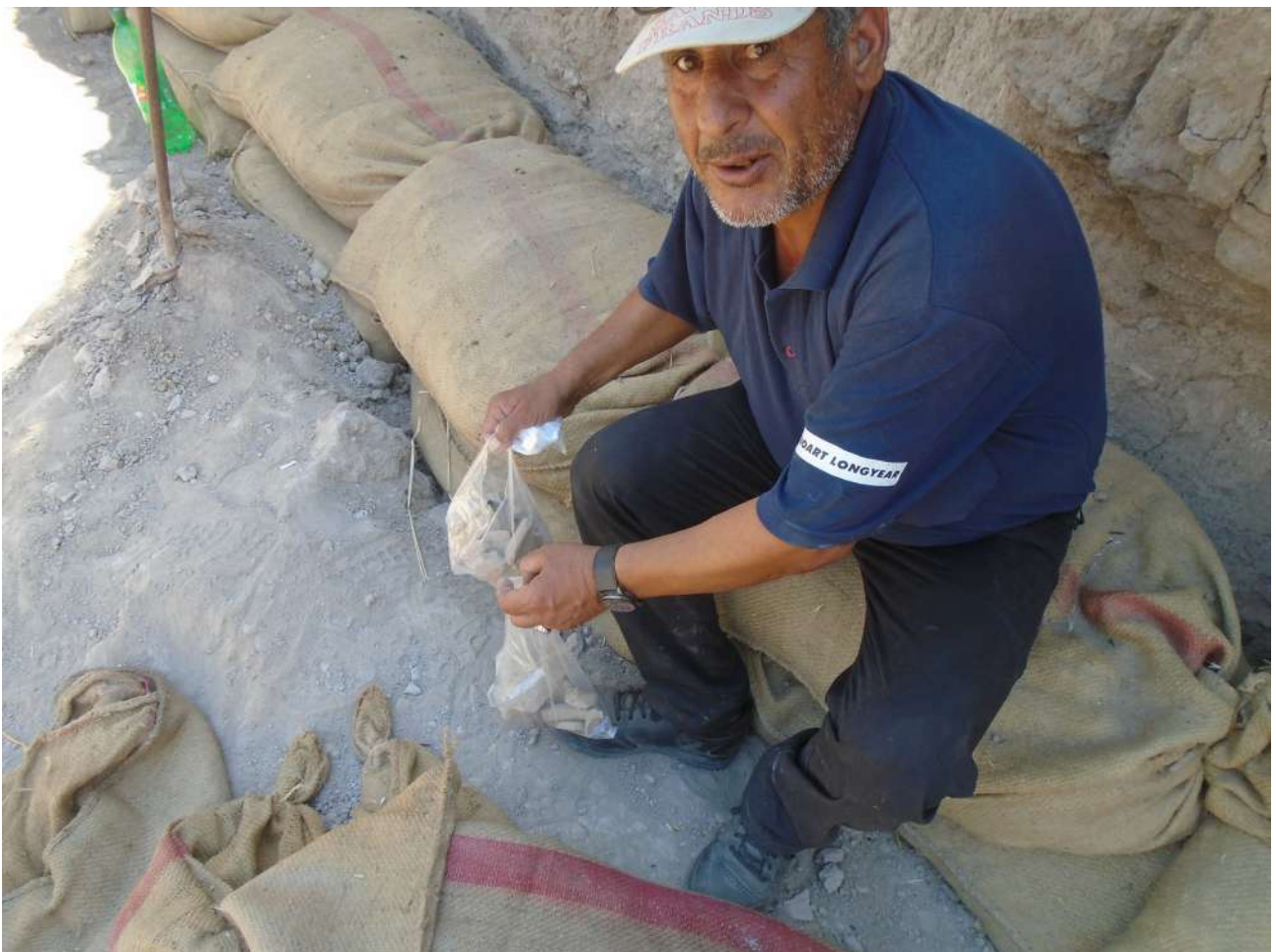
Fig.16 . The pottery shards are put in plastic bags - the unit J1