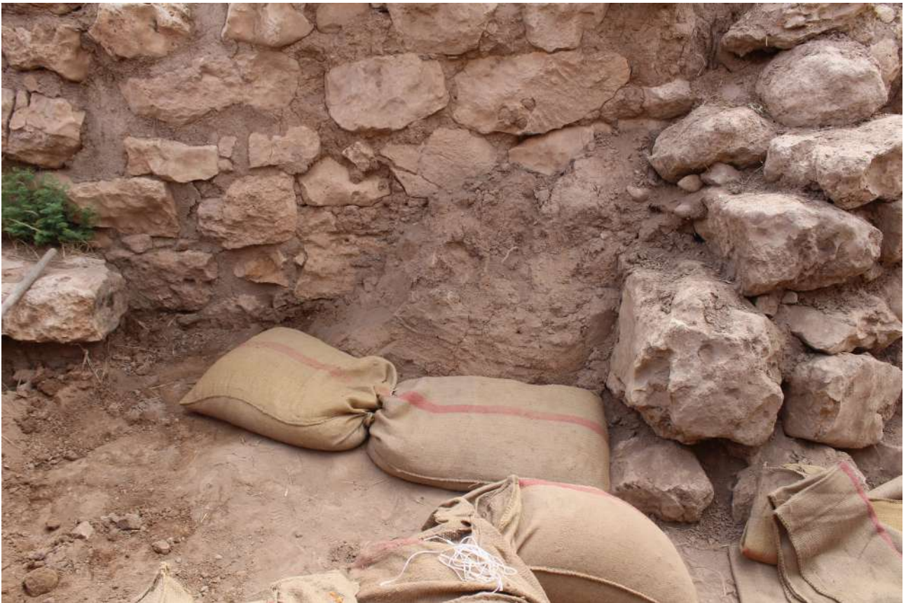
Fig.9 . Burlap bags filled with soil - the unit J5