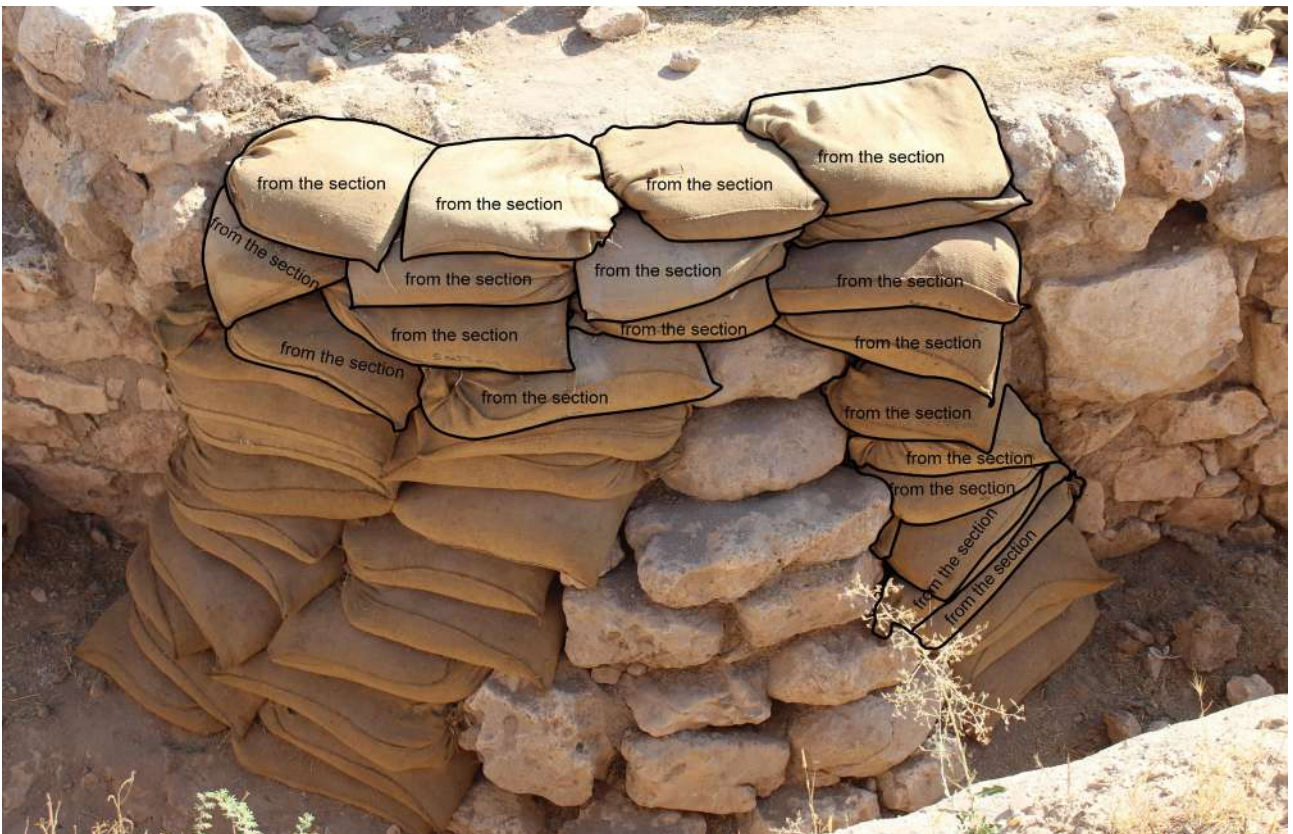
Fig.20 . Photo illustrating the bags which have been filled from the collapsed section