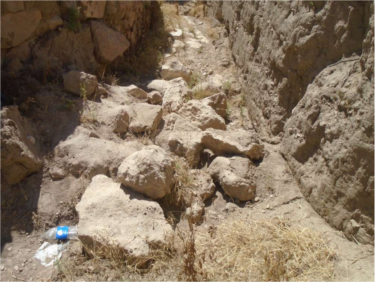
Fig.3 . The accumulated soil and scattered stones - the unit J5

So we suggested the repositioning of stones somehow, as a support to protect the wall of the temple in the unit J5, as well as keeping them until the return of the Mission .