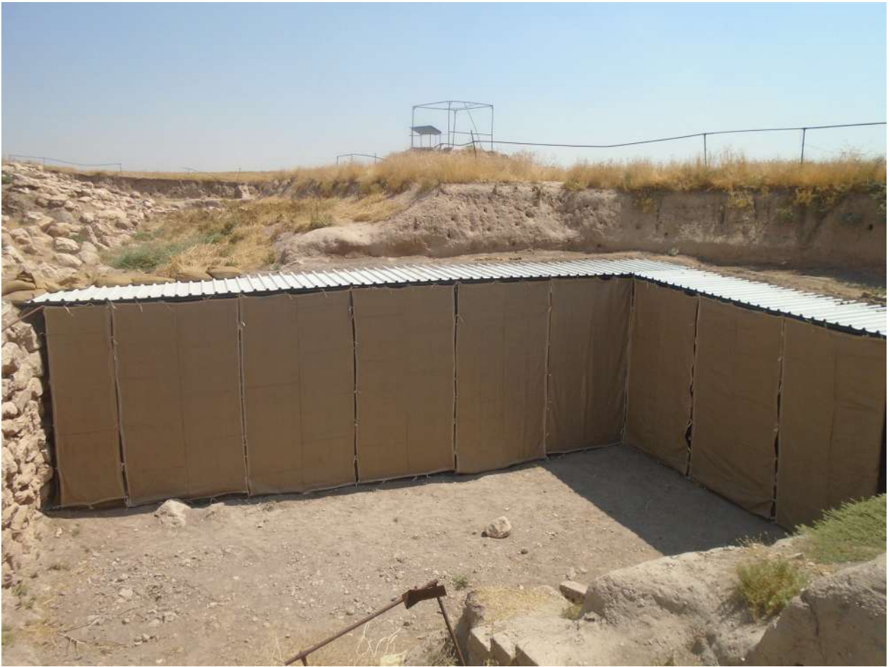
Fig.33 . The unit J1 from the northwest side

We painted the tutia in the unit J1, where we have mixed three colors, light brown, white and orange ( Fig. 34 ), in order to be as close as possible to earthy color ( Fig.35 and 36 ) .