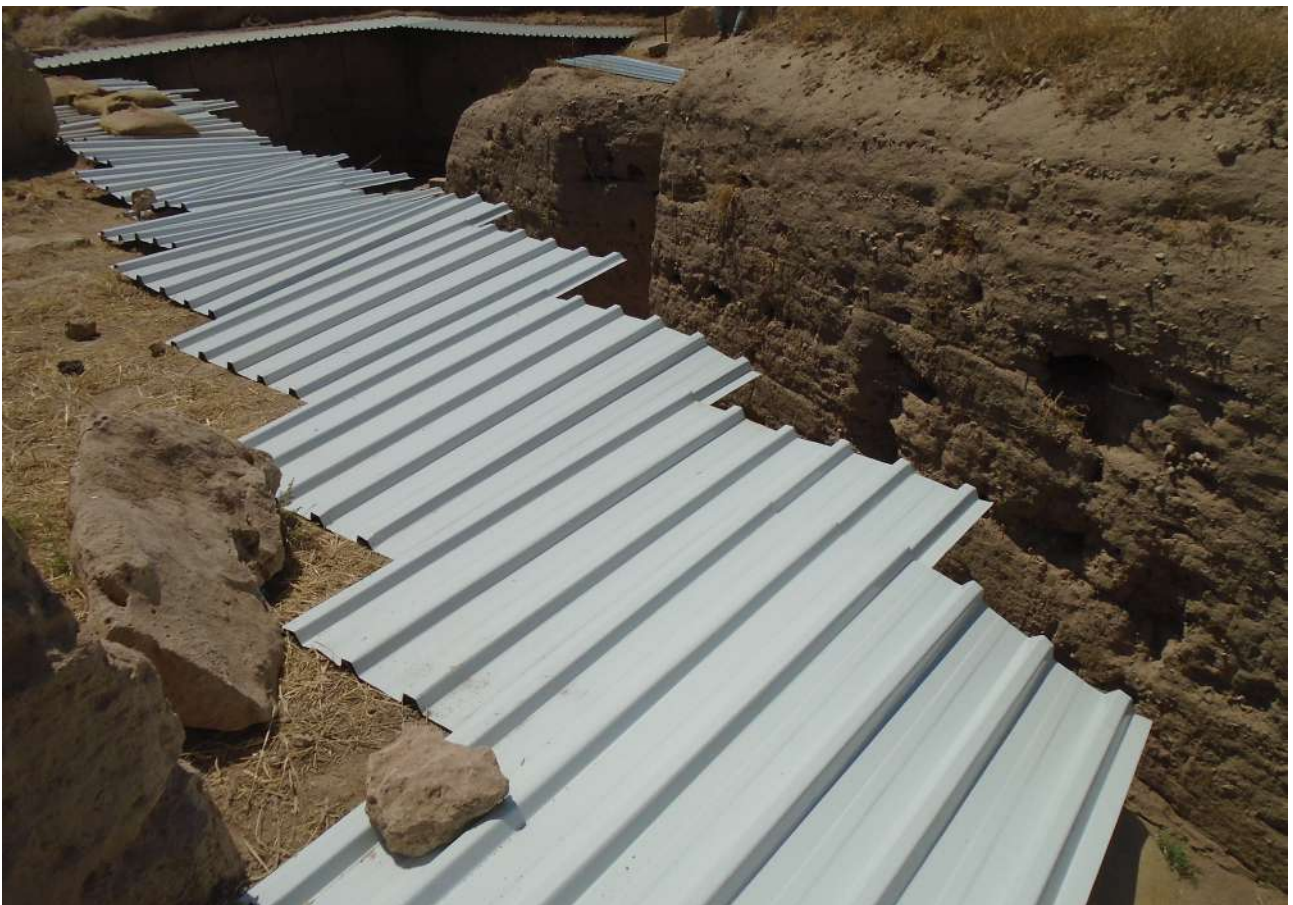
Fig.29 . The sheets of tutia are waving because of stones - the wall of temple