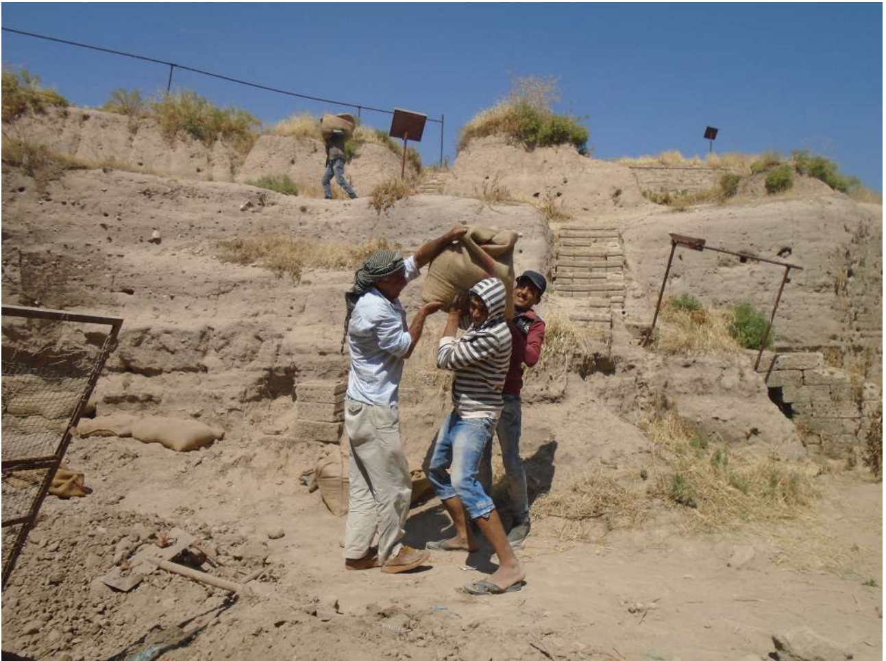
Fig.17 . Transferring the soil bags to the top - the unit J1