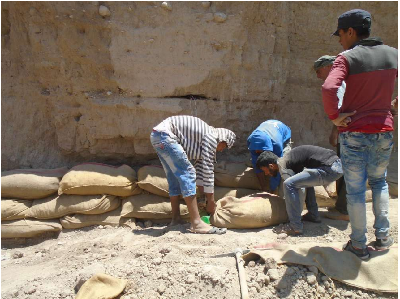
Fig.18 . Placing the soil bags - the unit J1

As for the unit J5, after we ran out of the soil which collapsed from the original buttress, we had to use the soil which also had previously collapsed from the section in front of the buttress ( Fig.19 ), the bags which have been filled from the section's crumbled soil, I named them as (from section), the photo which I have drawn by Freehand Program will illustrate them ( Fig.20 ), then we continued placing one bag on top of the other, until the work in this unit was entirely finished ( Fig.21 ) .