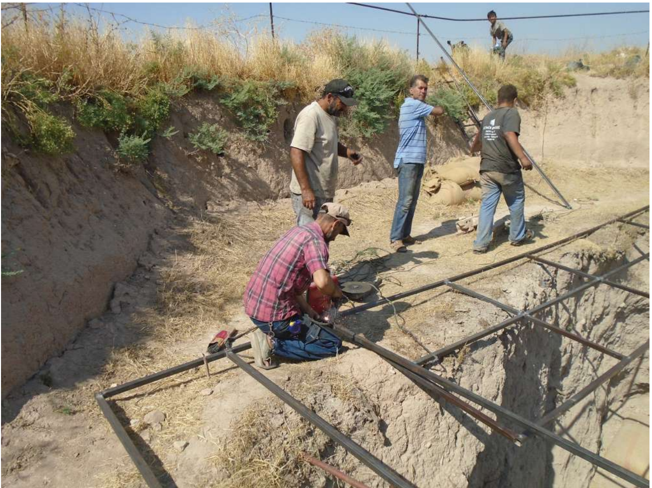
Fig.24 . installing the iron rods - the unit J1

After we have finished the work inside the unit J1, we moved to the second phase which is installing iron rods ( Fig.24 ) and covering them by metal sheet which is called in the local language as tutia ( Fig.25 ), where it was well fixed on the iron rods , in order to protect the section's wall from the rain in the next winter seasons . we also welded the broken western door leading to the unit J1 ( Fig.26 ) . thus we finished our work in the unit J1 ( Fig.27 ) .