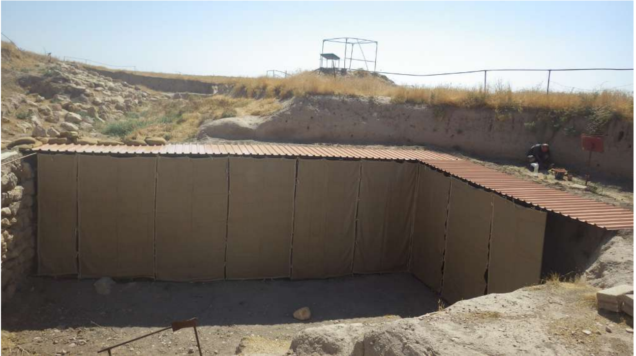
Fig.36 . The unit J1 after painting process