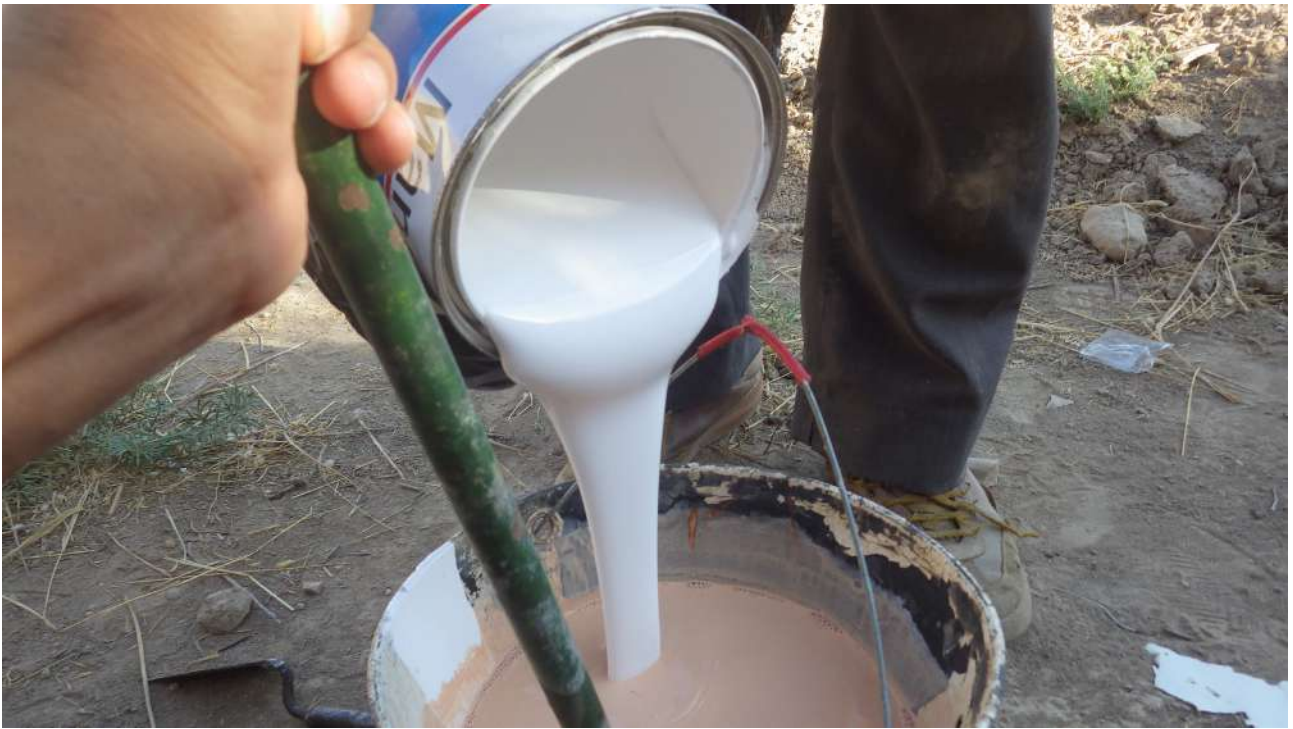
Fig.34 . Mixing the color