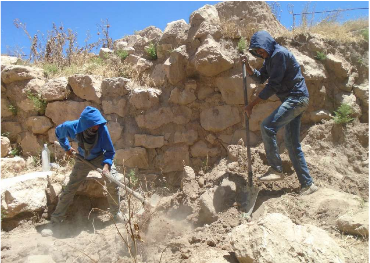
Fig.4 . Removing the soil - the unit J5