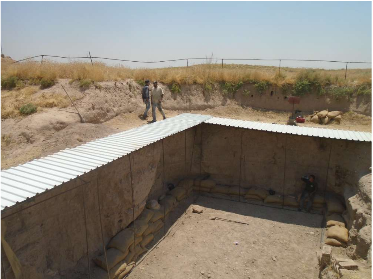
Fig.27 . Iron rods and tutia secured in place, in the unit J1