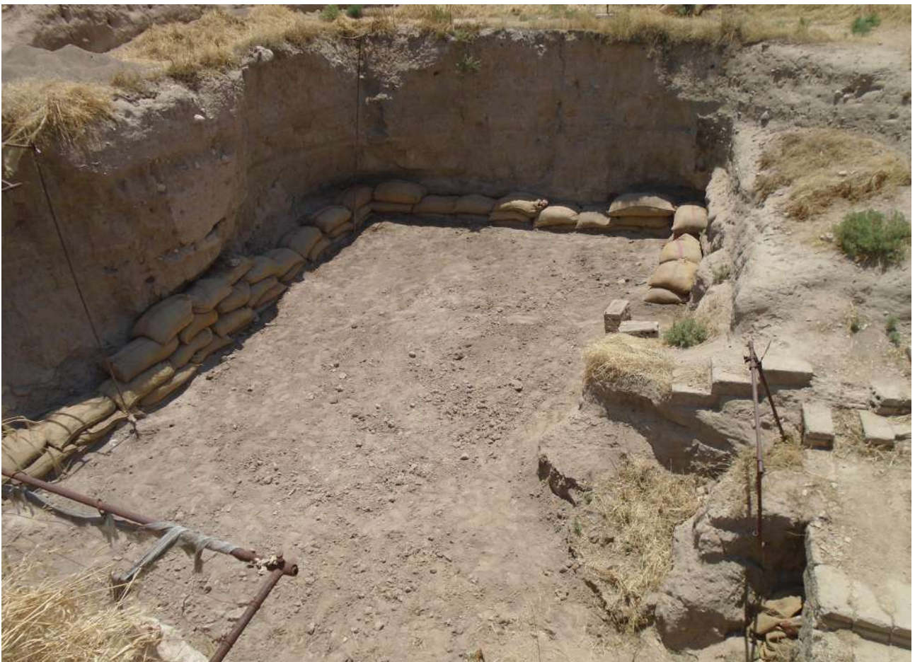
Fig.23 . View of the end result in the unit J1