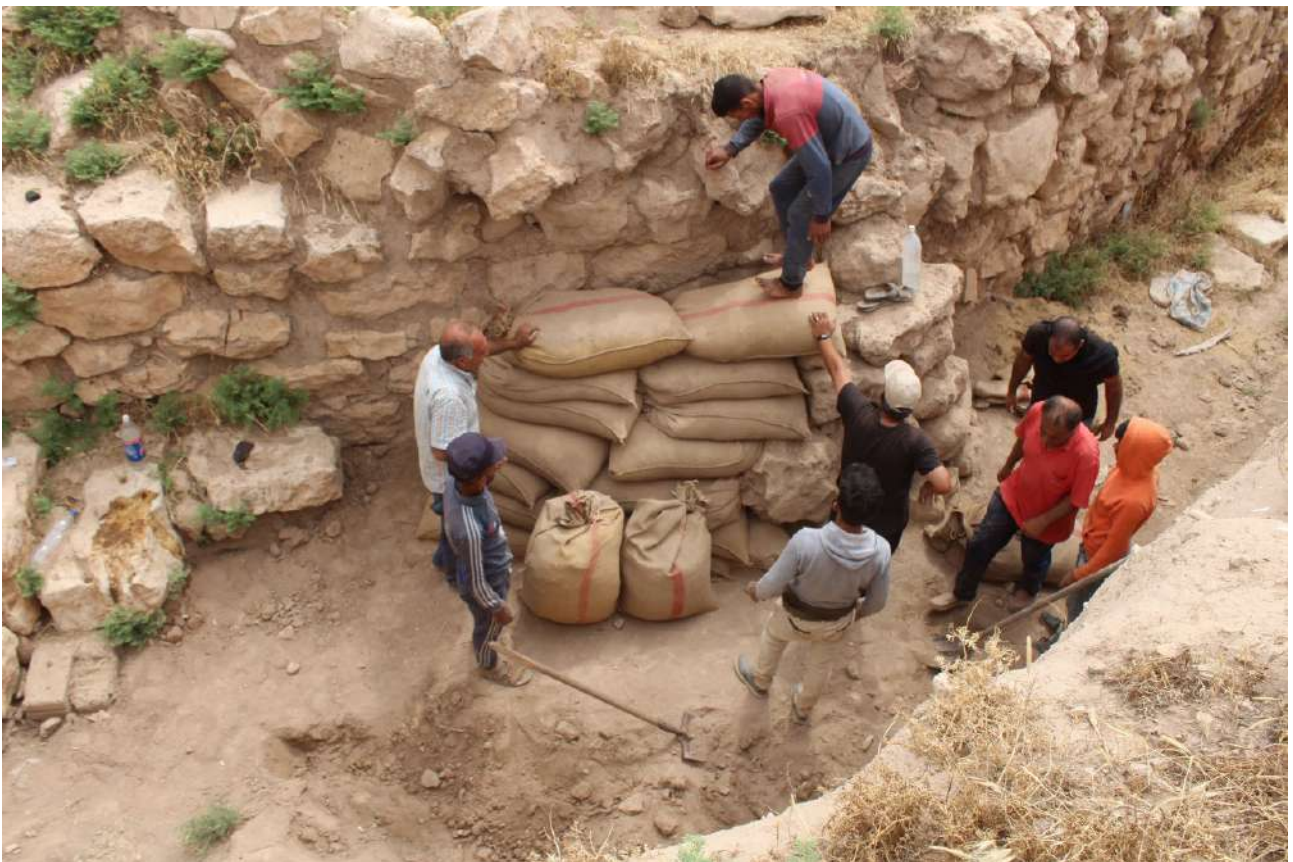
Fig. 10 . The highest point we reached on third day - the unit J5